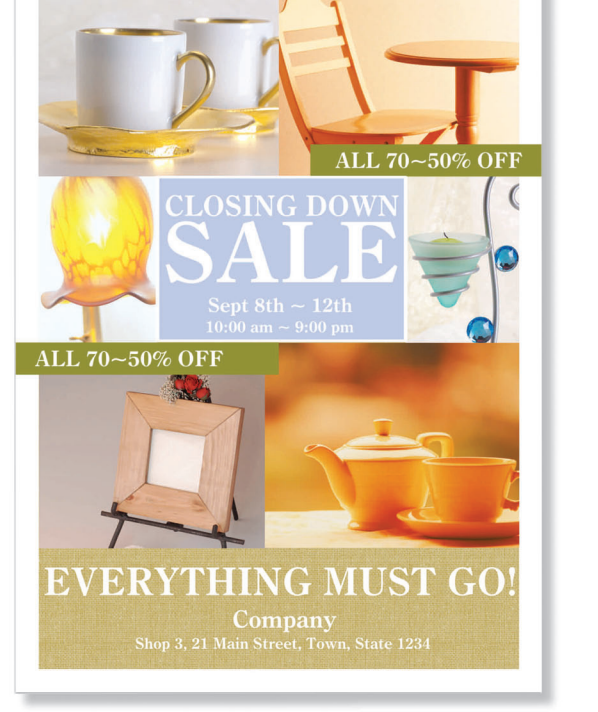
Created in PosterArtist 2007