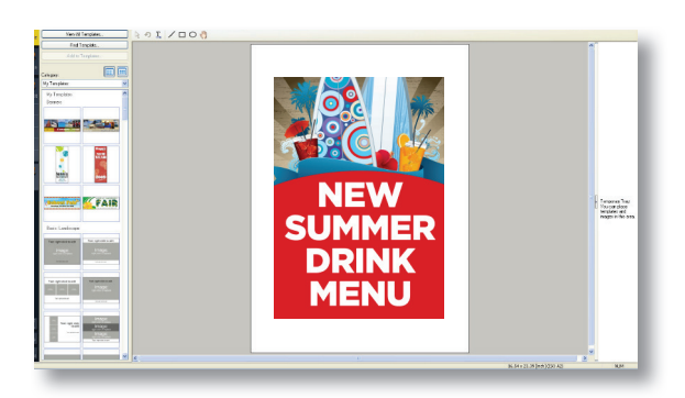
PosterArtist poster creation software

The iPF SE Series is an ideal solution for anyone looking to create eye-popping posters, banners, and infographics. With these types of users in mind, Canon has designed the iPF SE Series to be integrated seamlessly with its PosterArtist Lite software. This easy-to-use software is template-driven and includes predesigned templates, royalty-free images, and clip art. Users can create professional posters, banners, and signage in just four easy steps-for almost any application! A new image correction function for PosterArtist Lite automatically corrects image colors and enables a "cut out" function where selected areas of an image, such as backgrounds, can be removed for enhanced customization. A free version of PosterArtist Lite comes with every iPF8400SE and iPF6400SE printer, and a full version of PosterArtist is available for purchase. The full version includes some added value features such as an expanded library of templates and variable data printing.