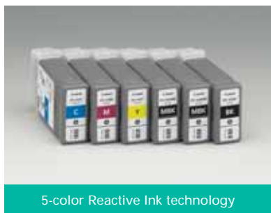
5-color Reactive Ink technology