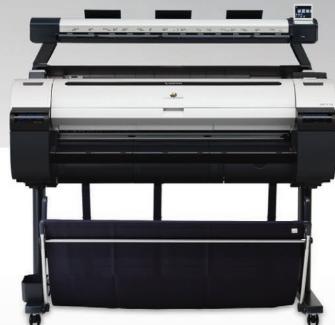
iPF770 MFP L36