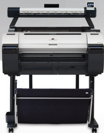
iPF670 MFP L24

Accounting Manager: This management tool easily helps track costs and allocate consumable expenses to projects. It also allows you to track print jobs by user to calculate ink and media (PC only).